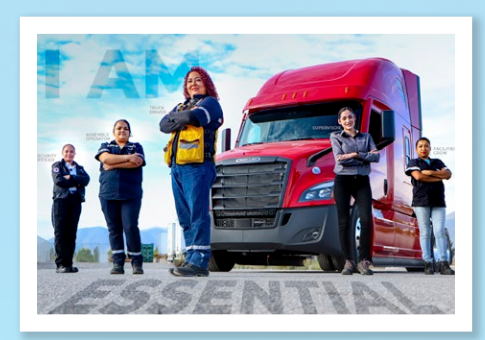
2021: "I Am Essential" is the theme for the "I Heart Trucking" Photo Contest as WIT members and the transportation industry at-large navigate through the worldwide COVID pandemic.