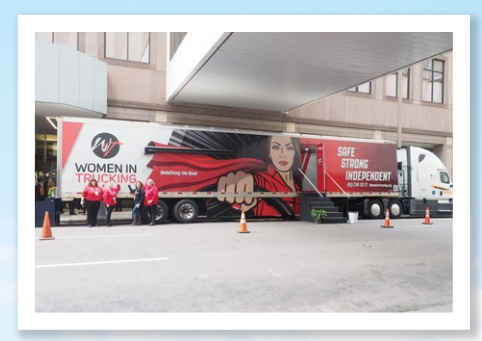
2021: Professional drivers who are on the WIT Image Team pose next to WITney at her unveiling in downtown Dallas during the 2021 WIT Accelerate! Conference & Expo. WITney is an educational mobile unit with interactive kiosks that quiz visitors on their knowledge of trucking and educates them about opportunities in the industry.